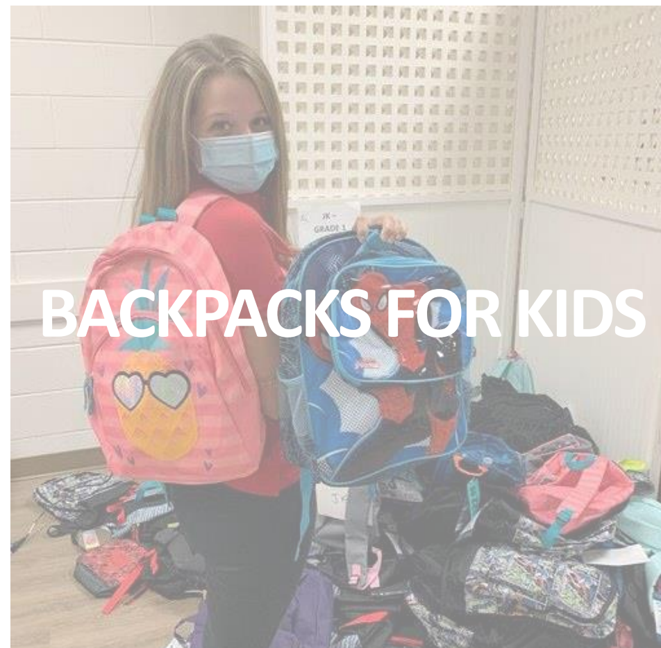
BACKPACKS FOR KIDS