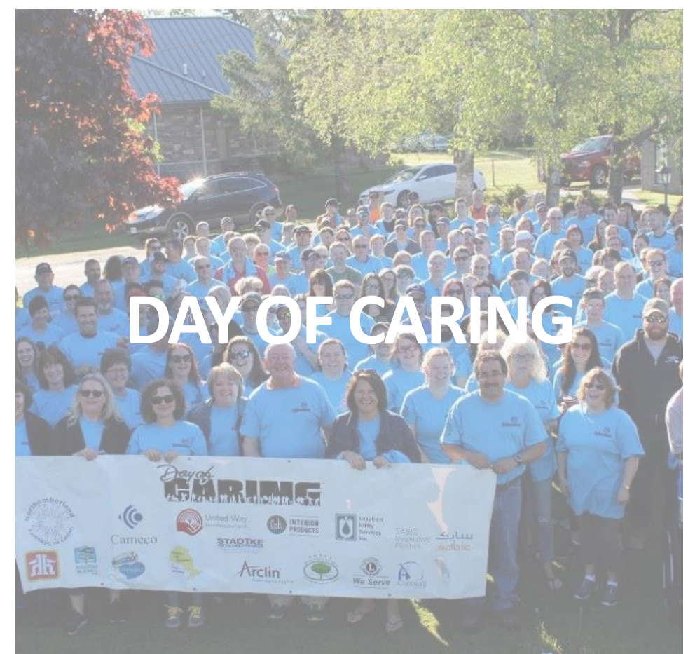
DAY OF CARING