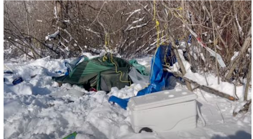
Photo: Today's Northumberland Article, Jan 18, 2022 'Exclusive – Homeless Couple Freed by Rookie Port Hope Police Officer After Tent Collapses During Storm'