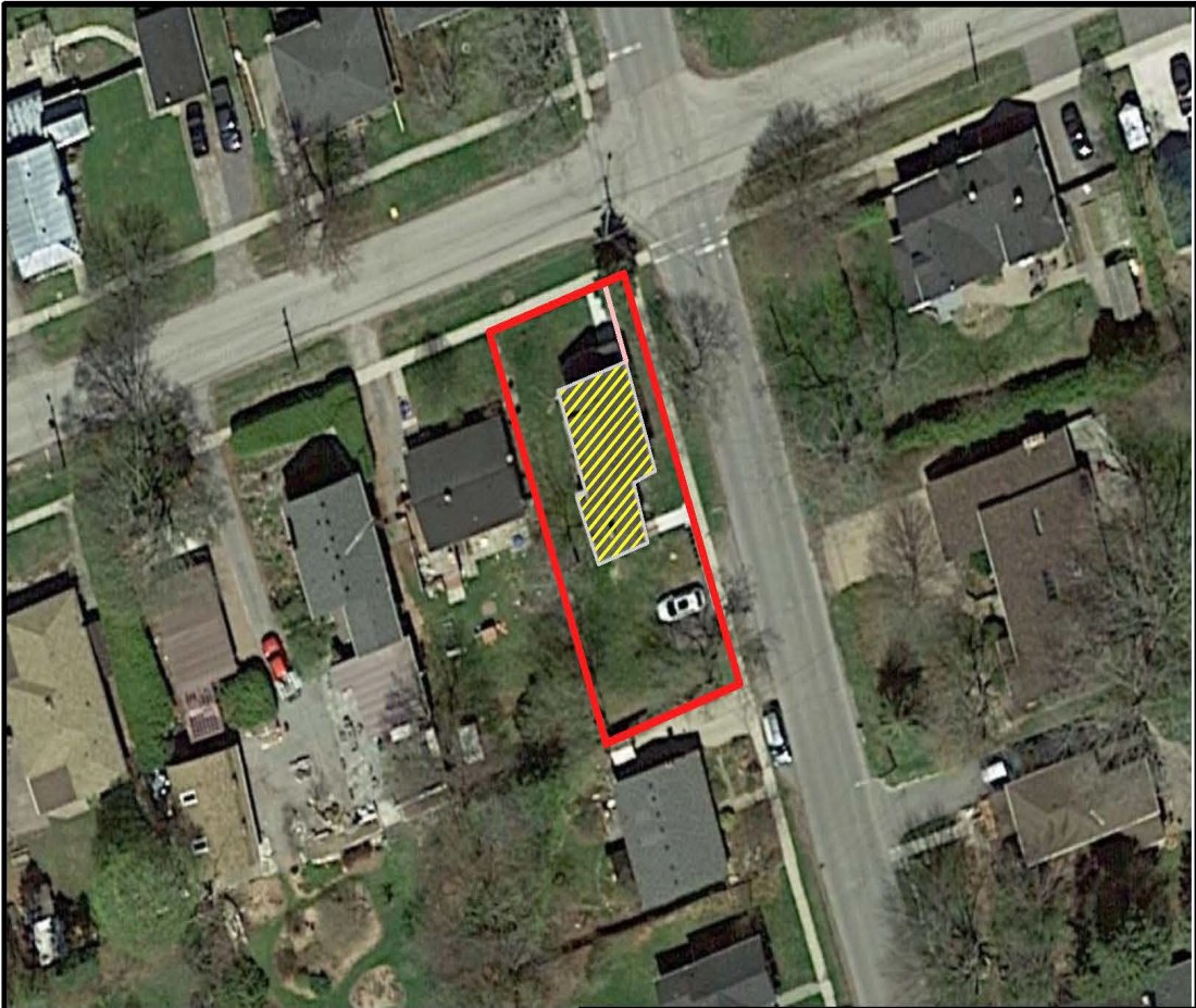
27 College Street, Port Hope, ON L1A 1X6