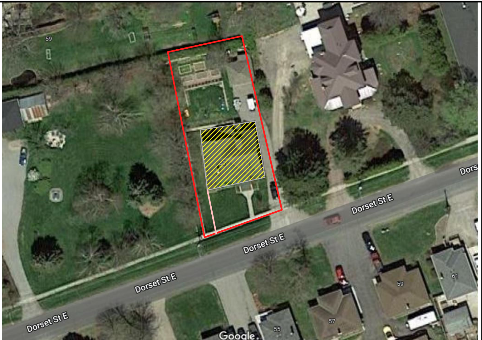
46 Dorset St E., Port Hope, ON L1A 1E3