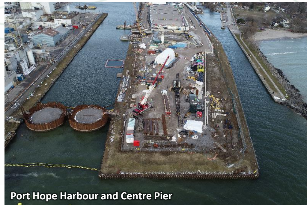
Port Hope Harbour and Centre Pier