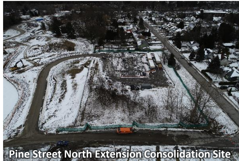
Pine Street North Extension Consolidation Site