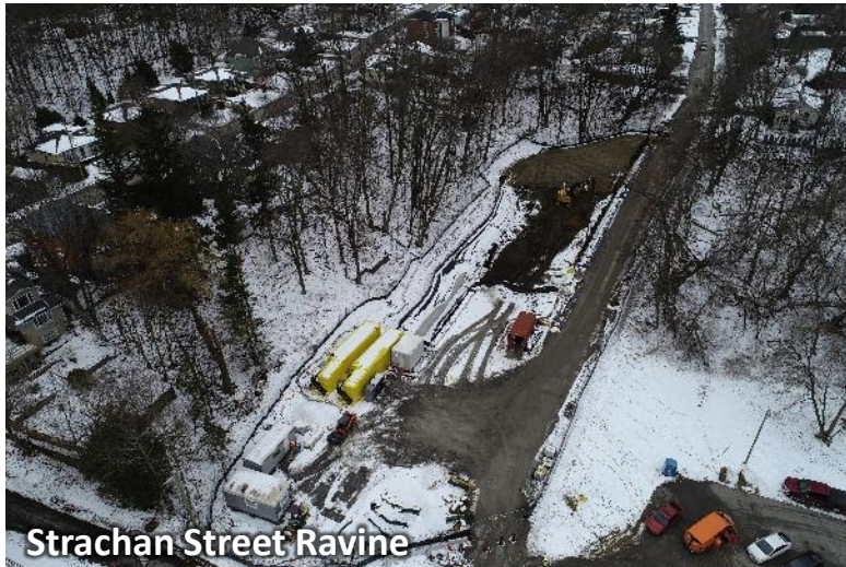
Strachan Street Ravine