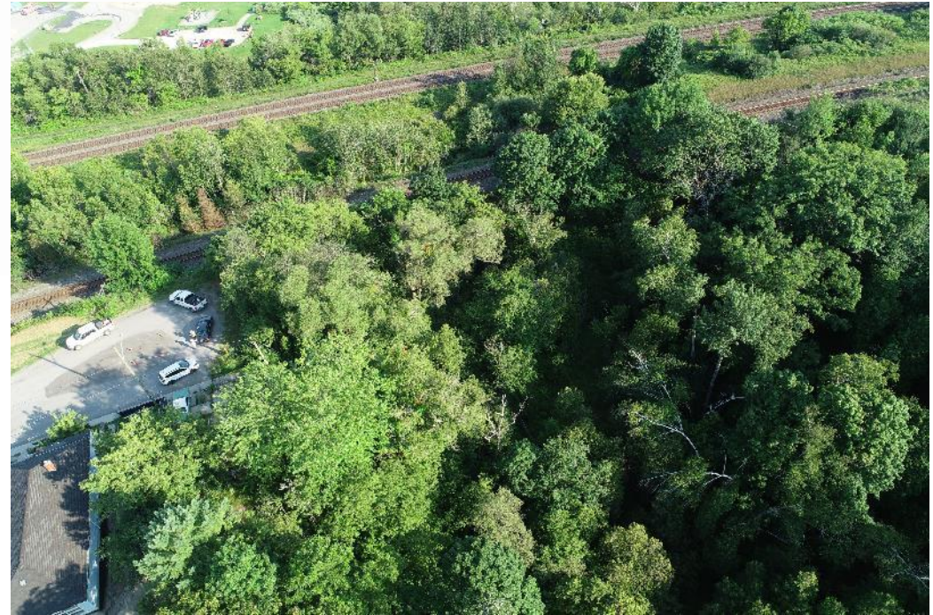
Alexander Street Ravine