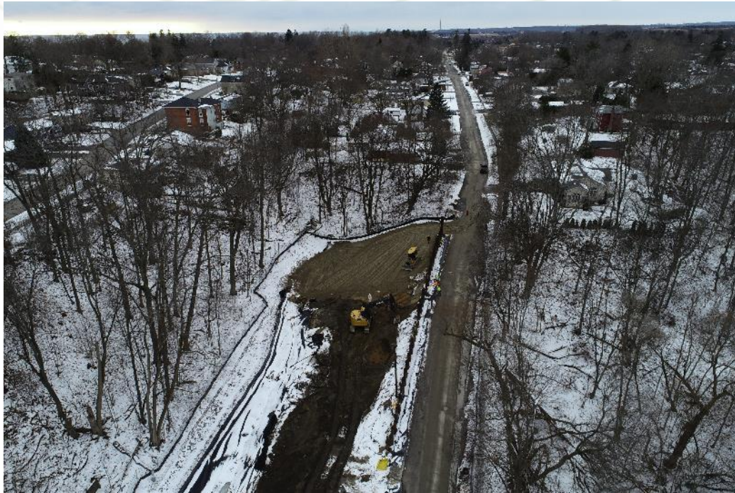
Strachan Street Ravine