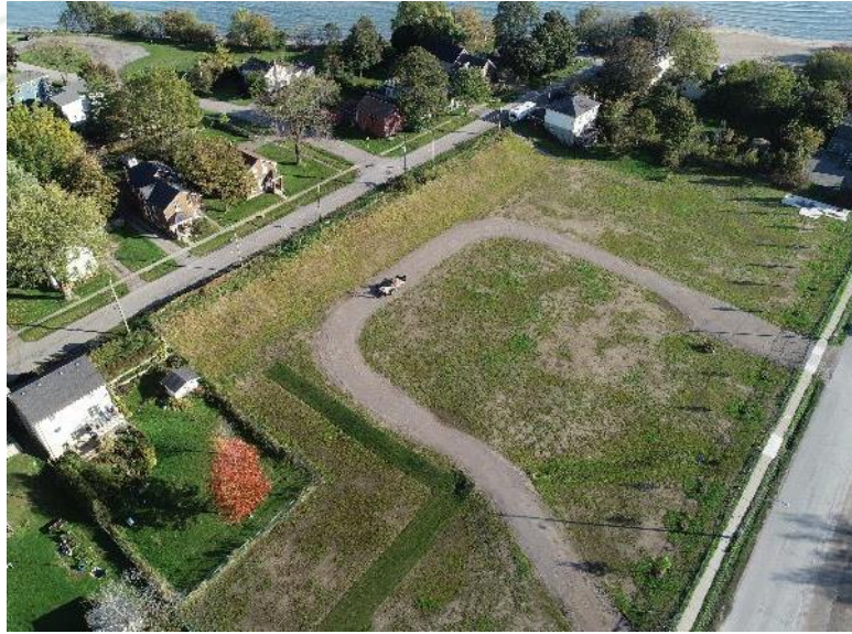
Mill Street COMPLETED