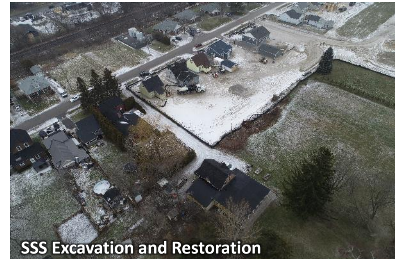
SSS Excavation and Restoration